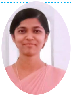
S. Jaya Meda

You are an exemplary model for all ages Your heroic deeds could be filled in all pages Prominent and powerful is your intercession 'The Year of St. Joseph' is a sign of our admiration.